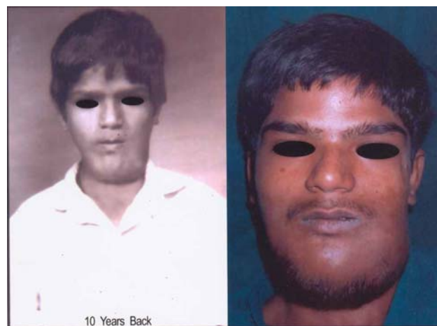
Figure 1 Extraoral photograph taken 10 years back and at present.

The blood picture was normal except for increased ESR (60/mm 1st hr). Orthopantomograph and lateral cephalogram revealed soft tissue shadow with no bony involvement. Computed tomography showed non homogenous mass of soft tissue density in the buccal aspect with no evidence of bone destruction which gave an impression of benign non-enhancing lesion of soft tissue mass. A provisional diagnosis of haemangioma was made with differential diagnosis of lymphangioma and rhabdomyoma.